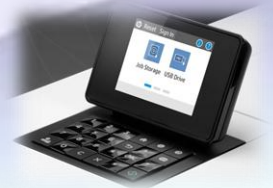
2.7 inch Color Graphics Display with 24-key pad